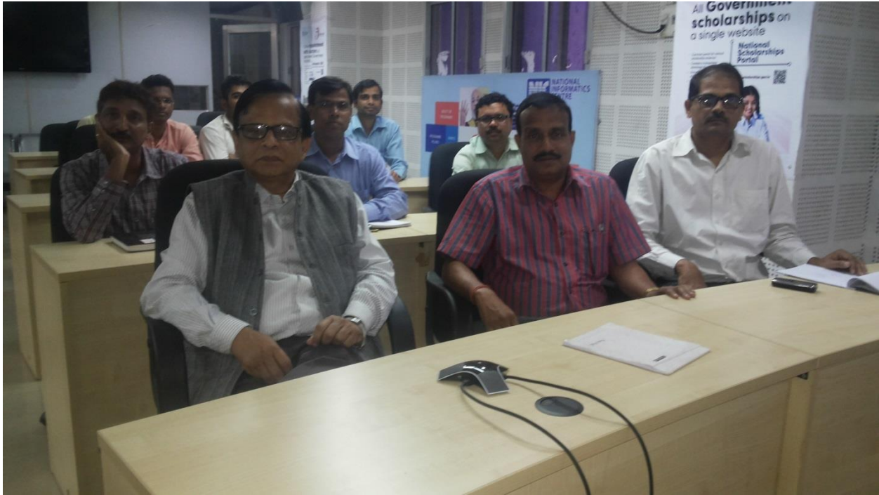
DDG & SIO with other participants in the session

He also informed that G-governance (Geographic Governance) initiatives have been taken at State and District levels by promoting and using Geo-Spatial technologies such as GIS, Remote Sensing, Image Processing, GPS, Mobile App and best practices for grass-root level planning and sustainable development. Geospatial technologies provide attractive integrated approaches for meeting current requirements to “do more with less.”