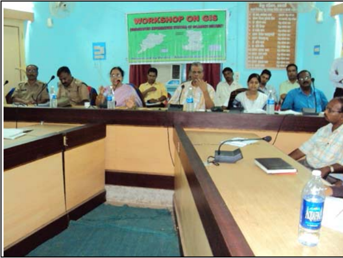
NIC District Unit, Gajapati.

Shri B K Samal Scientist-D, NIC Bhubaneswar and DIO, & DIA NIC Gajapati unit have conducted the training to the above staff. The training was imparted on both web based GIS and on Desktop GIS application using GIS software. Participants were trained on the basic aspects of GIS includes